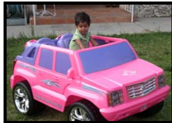
Daisy is a princess from head to toe and rides in style. < ^